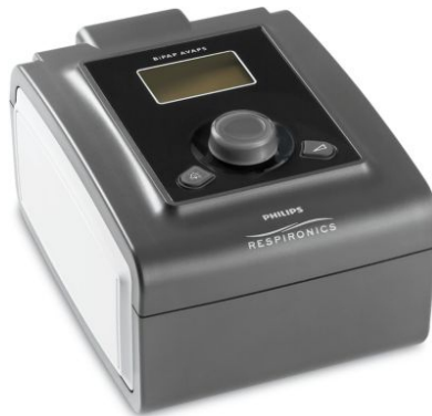
BIPAP & CPAP Machine PHILIPS AVAPS