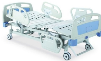
Three Function Electric Hospital Cot with Mattress