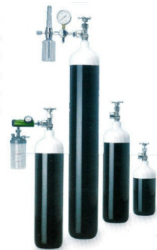
50 Ltr Oxygen Cylinder