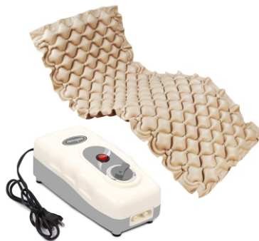
Bubble Type Air Mattress