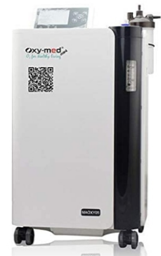
Oxy-Med 5 Ltr Oxygen Concentrator