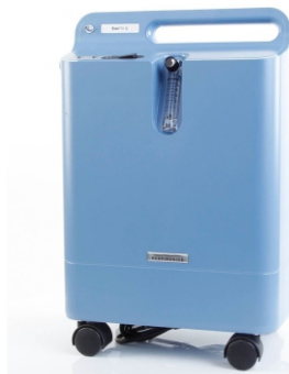
PHILIPS 5 Ltr Oxygen Concentrator