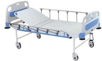
Two Function Manual Hospital Cot with Mattress