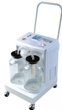
Double Jar Suction Machine