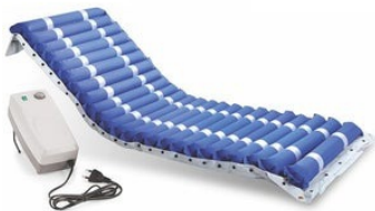
Tubular Air Air Mattress