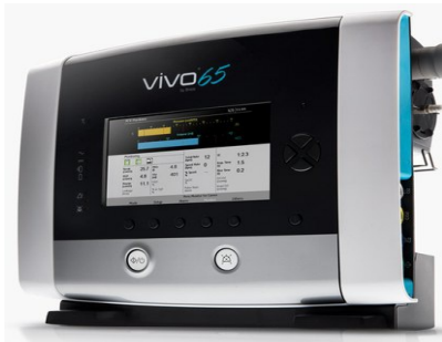
Home Ventilator Ventilator vivo 65