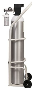
10 Ltr Oxygen Cylinder