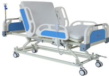
Five Function Electric Hospital Cot with Mattress