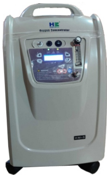
HOME MEDIX 10 Ltr Oxygen Concentrator