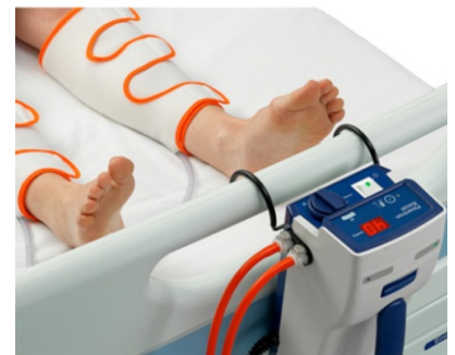
Devon Cirona DVT Pump